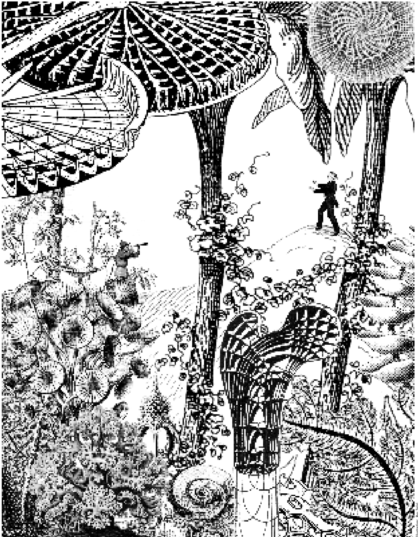
Illustration: Ryu Kajiri